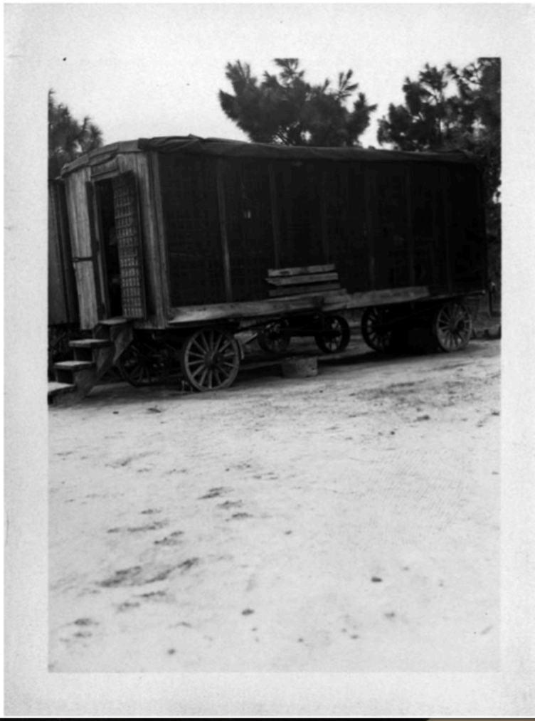
Figure 1.4. "The Cage: where convicts are herded like beasts of the jungle. The pan under it is the toilet receptacle. The stench from it hangs like a pall over the whole area" John Spivak, Georgia N_____, 1932.