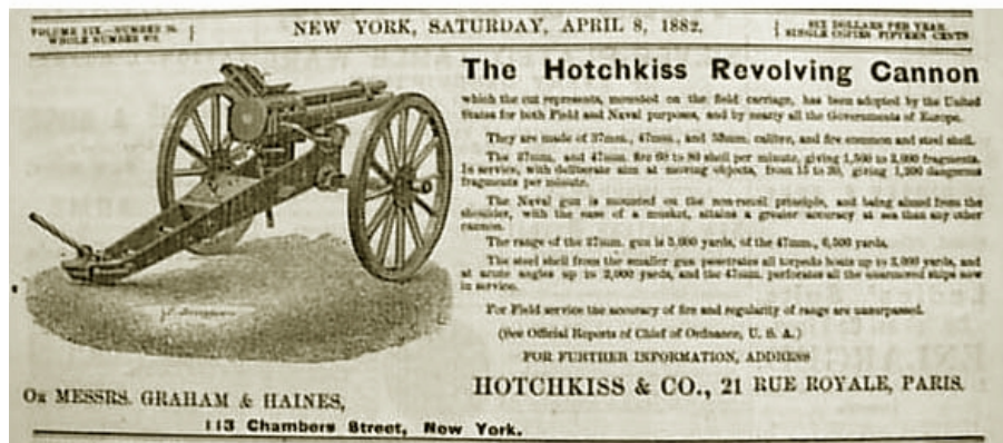
Figure 1.3. Hotchkiss Revolving Cannon

Ideologies of US settler colonialism directly informed Australian settler colonialism. South African apartheid townships, the kill-zones in what became the Philippine colony, then nation-state, the checkerboarding of Palestinian land with checkpoints, were modeled after U.S. seizures of land and containments of Indian bodies to reservations. The racial science developed in the U.S. (a settler colonial racial science) informed Hitler’s designs on racial purity (“This book is my bible” he said of Madison Grant’s The Passing of the Great Race ). The admiration is sometimes mutual, the doctors and administrators of forced sterilizations of black, Native, disabled, poor, and mostly female people - The Sterilization Act accompanied the Racial Integrity Act and the Pocohontas Exception - praised the Nazi eugenics program. Forced sterilizations became illegal in California in 1964. The management technologies of North American settler colonialism have provided the tools for internal colonialisms elsewhere.